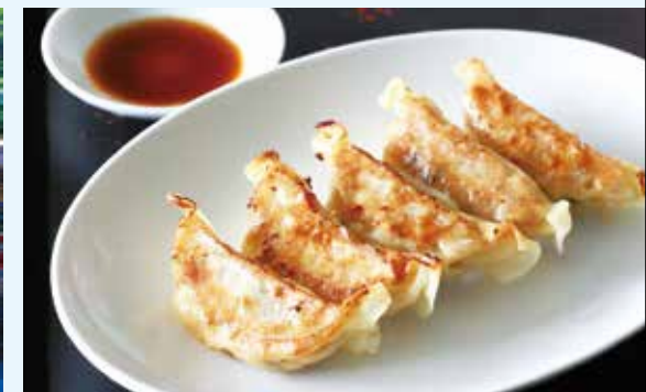
Utsunomiya gyoza dumplings