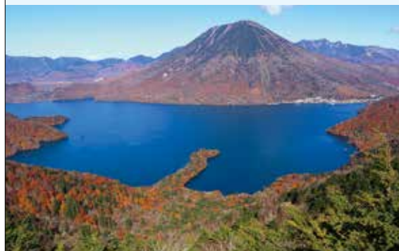
Mount Nantai and Chezenji Lake