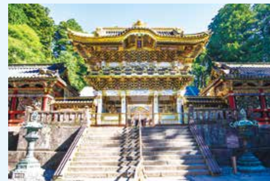
Nikko Toshogu (UNESCO World Herrytage)